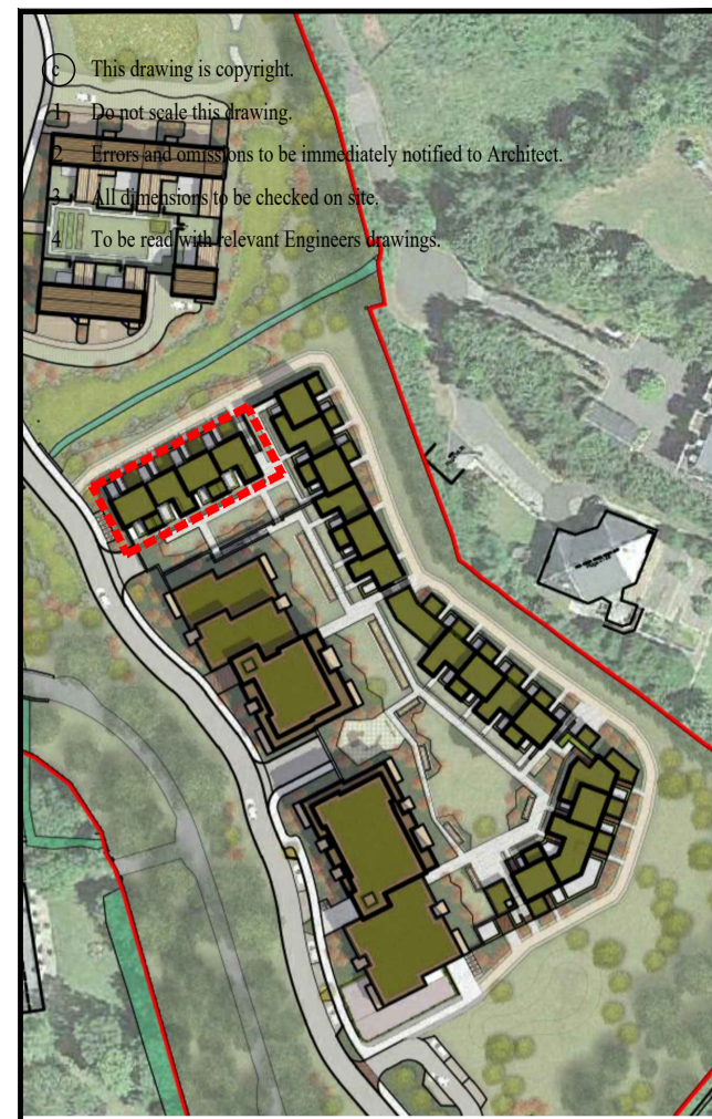
KEY PLAN INDICATING POSITION OF DUPLEX APARTMENT BLOCK 2A NOT TO SCALE

SEE THE BIG SPACE LANDSCAPE ARCHITECTS DRAWINGS FOR DETAIL OF LANDSCAPE TREATMENT